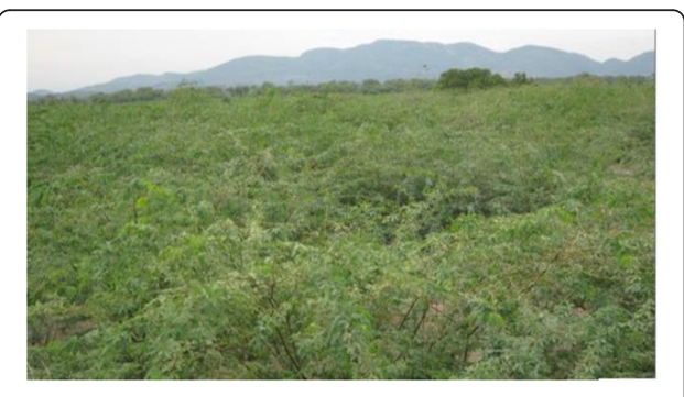
Fig. 3 P. juliflora encroachment at Bedlu-Ale grazing land, Middle Awash area

pastoralists' sustained existence (Chambers and Conway 1991). As the scale of encroachment of invasive species increases, its effect on the supply of ecosystem goods and livelihood activities also increases (Siges et al. 2005; Gemedo et al. 2006; Shackleton et al. 2006; Angassa and Oba 2008). In the Middle Awash area, majority of the households perceived that more than half of their grazing land is occupied by P. juliflora . During the survey, I also realized that a significant proportion of grazing lands were already encroached by the plant as shown in Fig. 3. The invasion forms impermeable, dense thickets, reducing grass cover of grazing lands. Despite this, it was the extended fodder/forage source areas which would guarantee the existence of pastoralism in their fragile ecosystem.