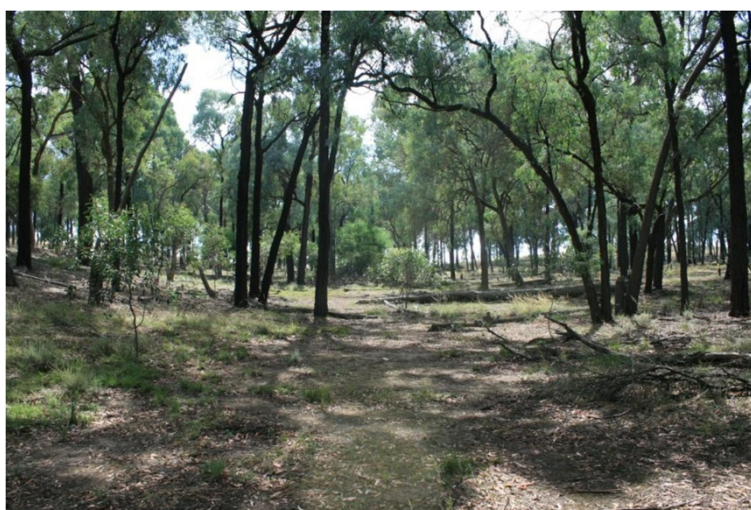
Figure 3 Vegetation community of the lower hills: eucalypt woodland with a sparse understorey of shrubs, herbs and grasses and with leaf litter dominating the groundlayer (EVC box ironbark forest).

sampled at a site differed to ensure that the area surveyed was proportional to the size of each site. Dimensions of the 120 m 2 quadrats differed based on the shape of the restoration site. A systematic search was conducted to locate planted and regenerating individuals in each quadrat. The species type and the height and diameter at base were recorded for each plant. Diameters were measured using Vernier calipers or a diameter measuring tape where the diameter exceeded 150 mm. Heights were measured using a 2 m ruler or a Silva clinometer for taller plants. The presence of reproductive material (buds, flowers, fruits) was recorded for each plant. Remnant trees were measured using the same method if they were present within a sampled quadrat. Recruitment was considered episodic if there were large numbers of individuals of the same age class and species within a quadrat (for example, if there were river red-gum seedlings in a drainage line). Where regeneration was clearly arising from suckers, this was noted due to the different reproductive method.