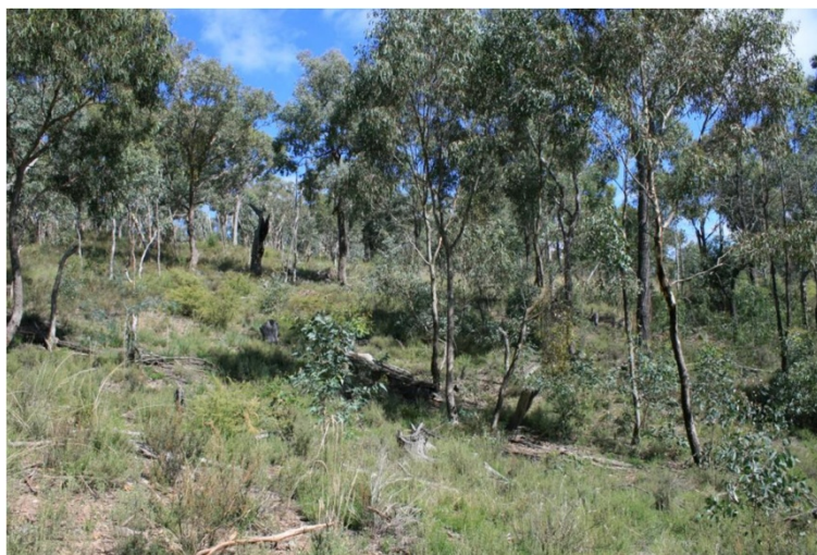
Figure 2 Vegetation community of the upper hills: eucalypt forest with a shrubby or grassy understorey (EVC shrubby dry forest / grassy dry forest).

Data were collected from 337 quadrats across 42 sites in the summer of 2010–2011. The number of quadrats